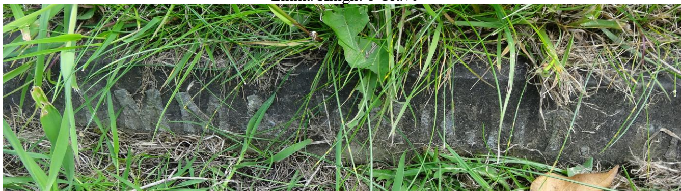
Emma Knight's Grave