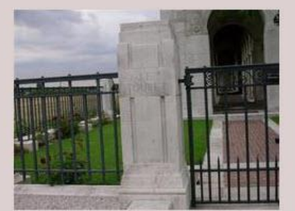
Added by: International Wargraves Photography Project